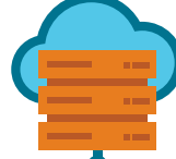
Artificial intelligence analysis