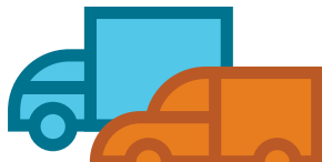
A fleet vehicle